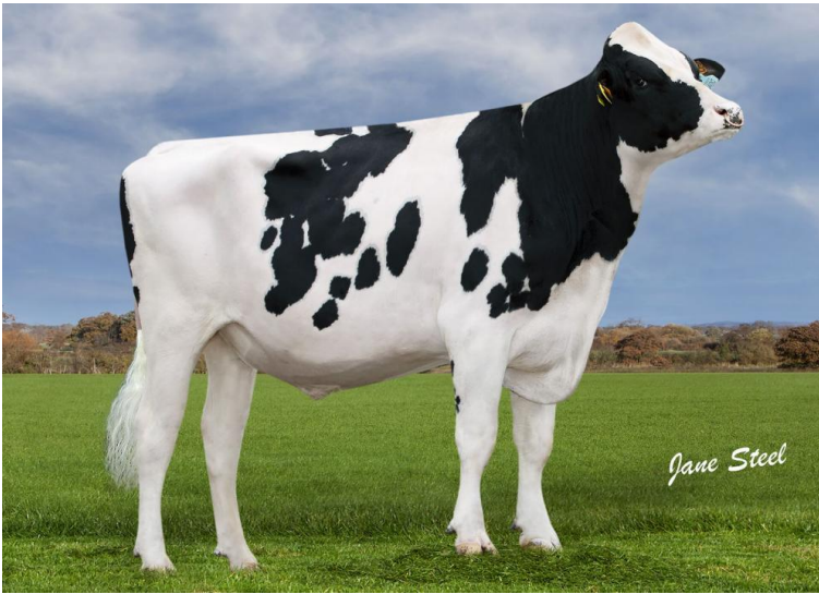
EBA Davinci EX-95

Davinci is the highest Dylan son worldwide according to TPI and comes from the very successful breeding of EBA Holsteins in France. Davinci can also convince according to the German breeding value and is currently one of the highest conformation sires on the market. However, Davinci not only convinces with excellent conformation, but also with high components, good cell values, high daughter fertility and solid health values. Davinci is also an all-rounder in many systems and not only tests very well in the USA and Canada, but also in Switzerland, France and Italy. Davinci is also available as sexed semen.